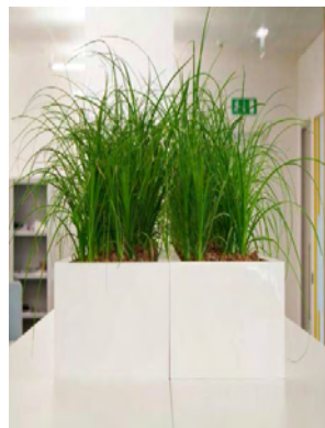
Enterprise Plants Hat of Knowledge

Also kicking of the week in West Sussex was a pop-up office by Pro Landscaper. Built in the courtyard outside their offices they attracted other businesses residing in the same area.