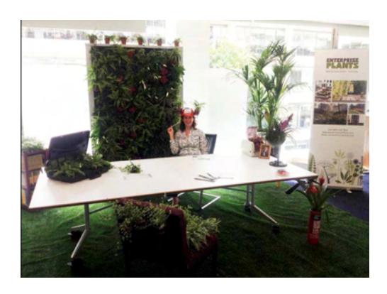
Day 2 at Associated Newspapers